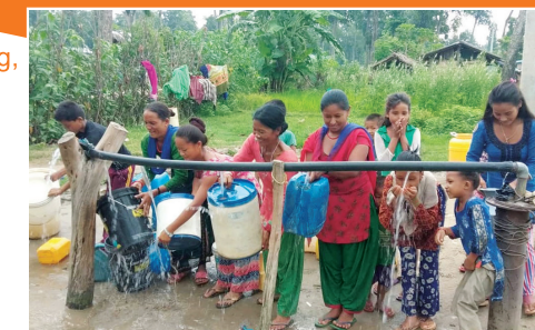
Beneficiaries of Dhangadhi FS Location